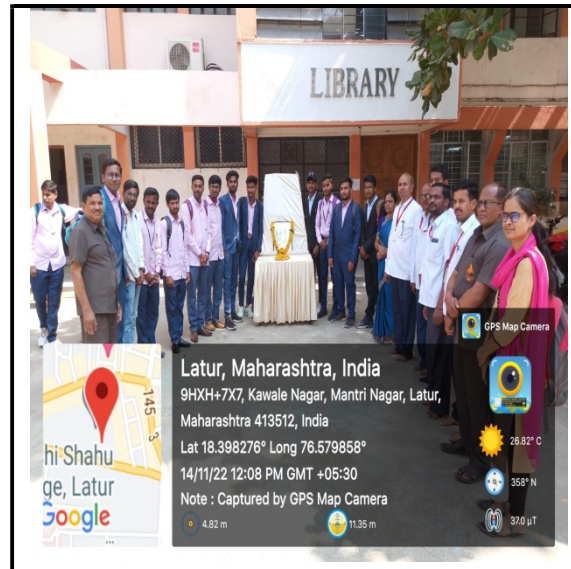
Students, Teaching & Nonteaching staff participant in the Pandit Jawaharlal Nehru's jayanti