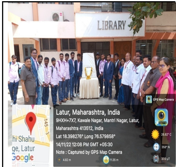
Students, Teaching & Nonteaching staff participant in the Pandit Jawaharlal Nehru's jayanti